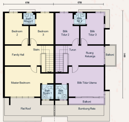
FIRST FLOOR Tingkat Atas / 一楼

LEGEND | PETUNJUK | 传奇 *Balcony [Corner unit only] | Balkon [Unit Sudut sahaja] | 阳台 [仅角头单位]